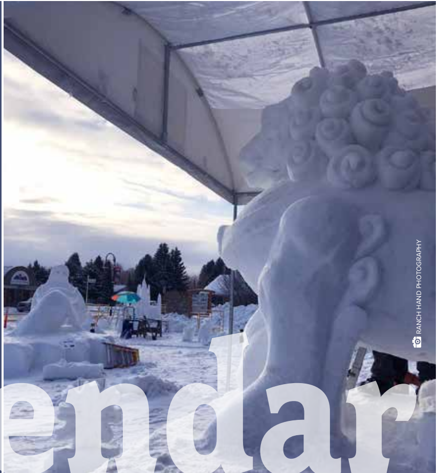
RANCH HAND PHOTOGRAPHY