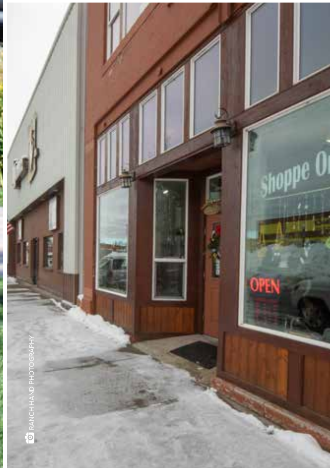
RANCH HAND PHOTOGRAPHY