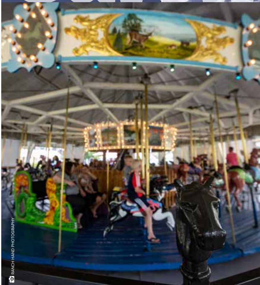
RANCH HAND PHOTOGRAPHY