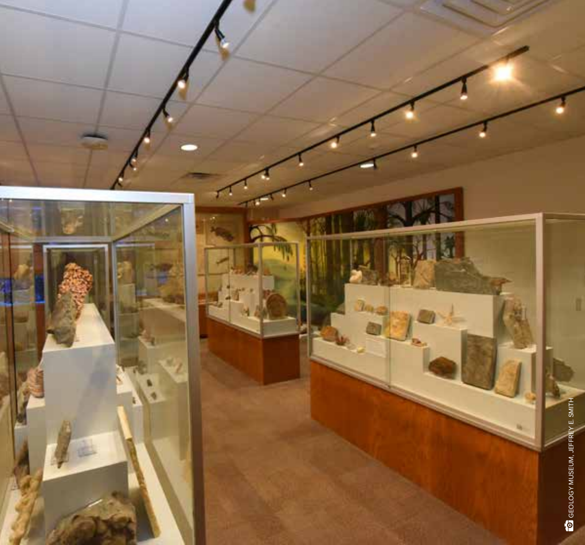
© GEOLOGY MUSEUM, JEFFREY E. SMITH